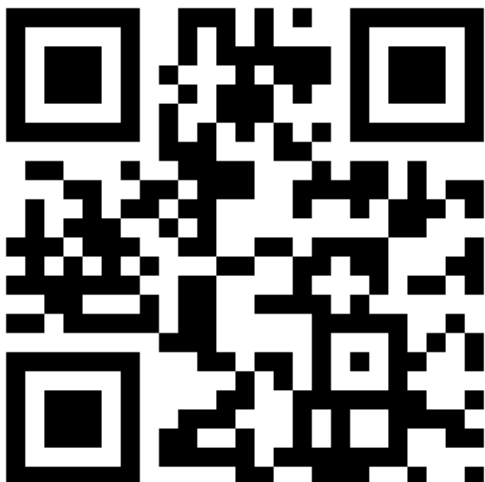
Question 5: Horror QR Code Clue